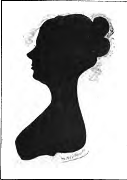
MARY MOODY EMERSON